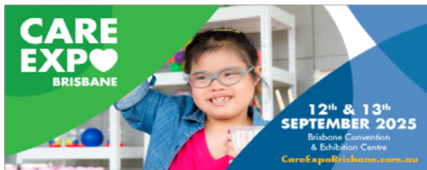
Email Signature 1