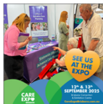
Social Media Post 2