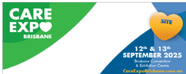
Email Signature Template 1