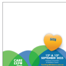
Social Media Post Template 1