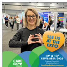
Social Media Post 1